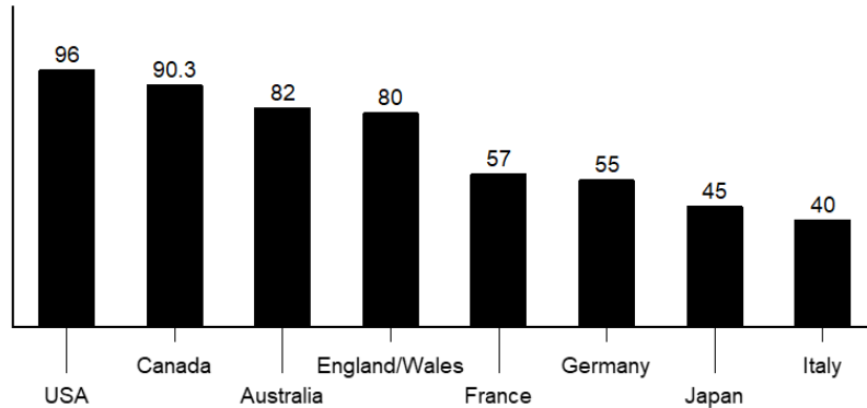
Figure 1. Imprisonment Rates per 100,000 of National Population, 1970.

What this graph adds to Professor Blumstein's analysis is a surprising comparative perspective. In 1970, the stable rates of imprisonment in the United States were strikingly similar to the imprisonment rates of several Western developed nations. When American imprisonment rates are measured against nations like Italy, Australia, England and Wales, the similarities are much more evident than any differences.